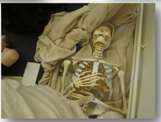
Year 5 Hook lesson