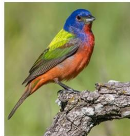
Pictured: A Painted Bunting bird can be seen at Sankofa Wetland Park and Nature Trail.

Community members in New Orleans have turned a vacant, rubbish-filled 40-acre area into a thriving wetland and haven for people and birds. Local residents are working together with the Sankofa Community Development Corporation (SCDC), which was set up by Rashida Ferdinand, to restore the wildlands she grew up exploring and playing in. The area that had suffered, due to decades of damage and neglect, has been restored to its previous natural glory and is now officially known as the Sankofa Wetland Park and Nature Trail. Wildlife has returned to the site, with the SCDC reporting that there are now over 100 species of songbirds, ducks, near-shore waders, egrets, herons, otters, beavers, and a variety of amphibians and reptiles. It is hoped that restoring the wetlands will also help to protect the residents and