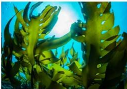
Pictured: Seaweed growing underwater.