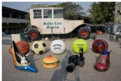
Pictured: Several of the custom cars at Sudha Cars Museum.