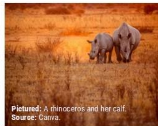
Pictured: A rhinoceros and her calf.

an extra pair of eyes that can keep track of animals and send us important information about where they are and what they need.' This smart robot is already helping conservationists learn more about how to protect endangered animals and keep them safe in the wild.