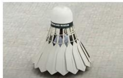
Pictured: The shuttlecock car.

If you were to create a custom car, what object would you choose to base it on?