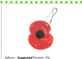
Reflector - Suggested Donation: 50p