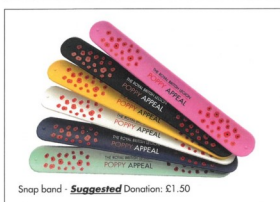
Snap band - Suggested Donation: £1.50