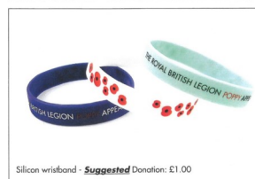
Silicon wristband - Suggested Donation: £1.00