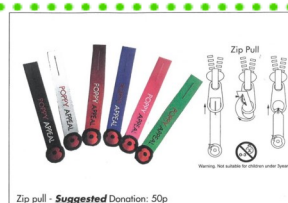
Zip pull - Suggested Donation: 50p