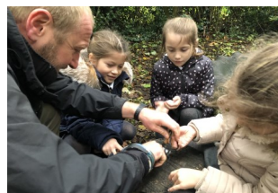
Surrey Outdoor Learning and making fires.