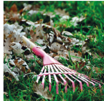
Raking up leaves