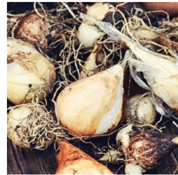
Bulbs ready for planting