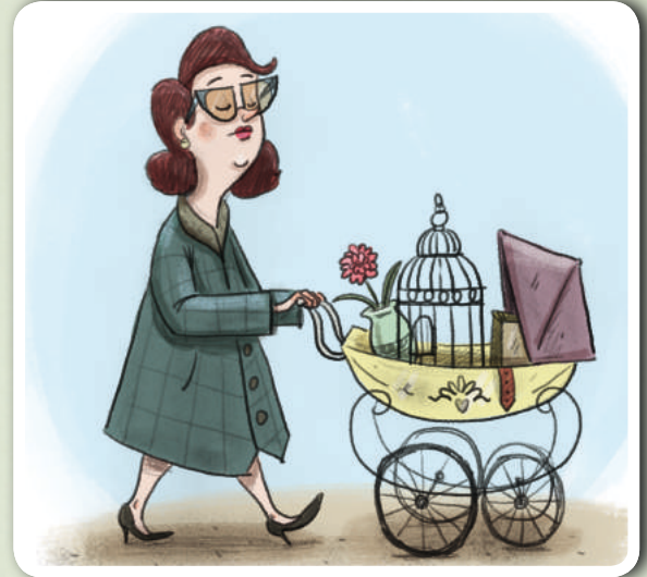
Dora the Storer